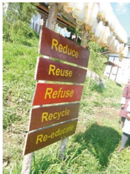
Photo. 4 GNH Practices