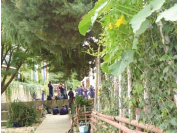
Photo. 2 A GNH School