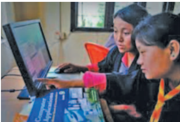
Photo 7 Students in a Community Center