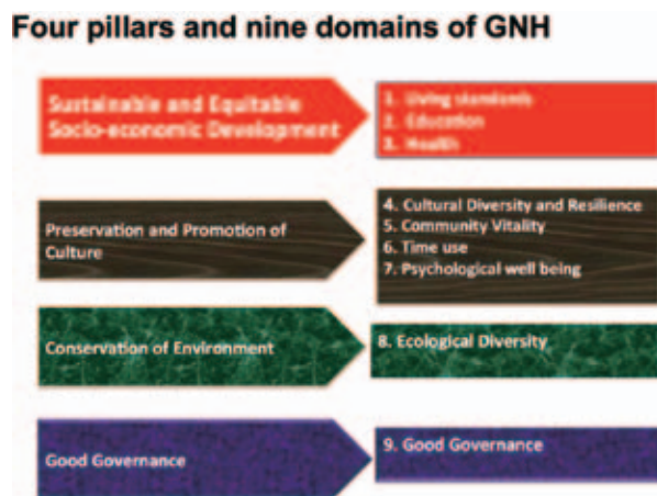
Figure 2 Pillars of GNH