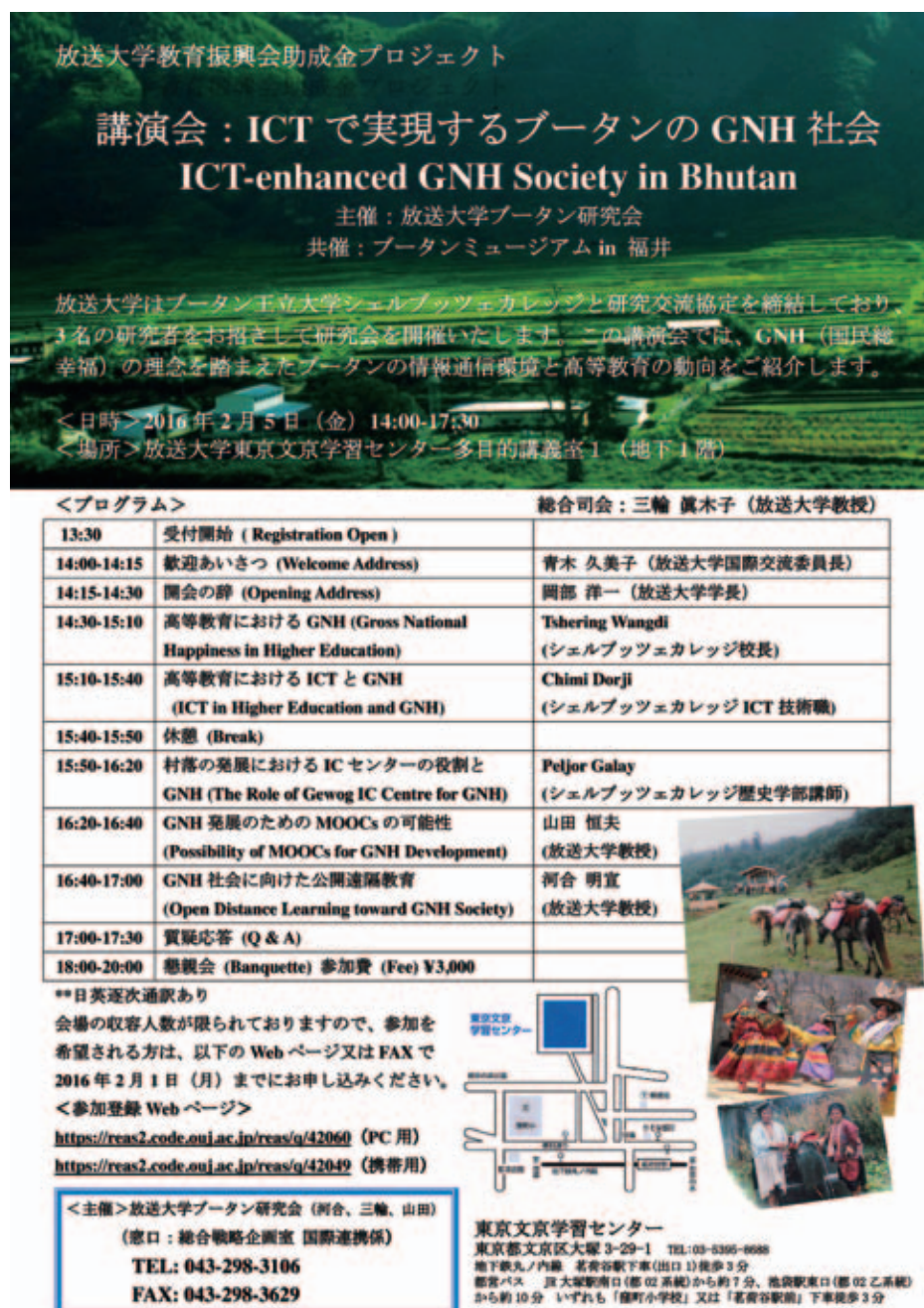
Figure 1（図1） ICTで実現するブータンのGNH社会