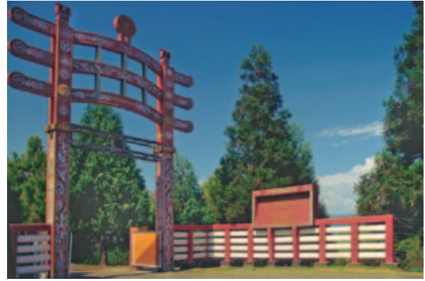
Photo 9 Sherubtse College, Kanglung