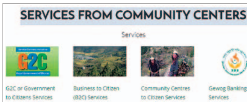
Photo 8 Services from Community Centers