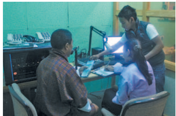
Photo 11 Radio Broadcasting by Sherubtse Students