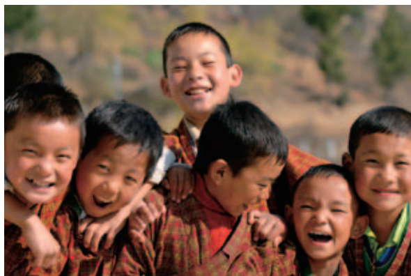
Photo 3 School Children