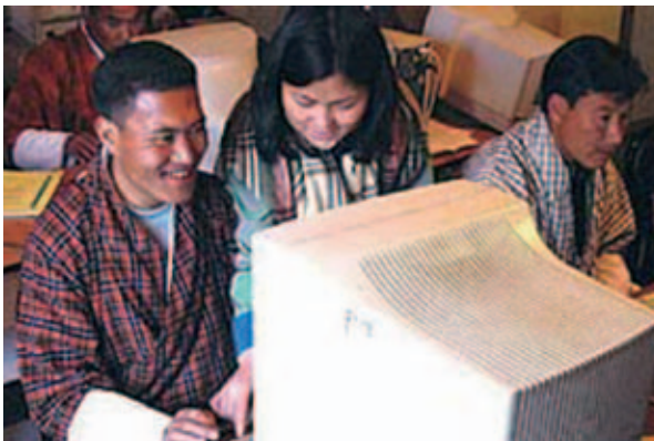
Photo 6 Getting a lesson on IT