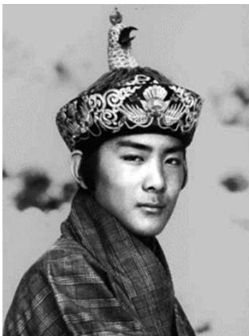
Photo 1 His Majesty King Jigme Singye Wangchuck The Fourth King of Bhutan