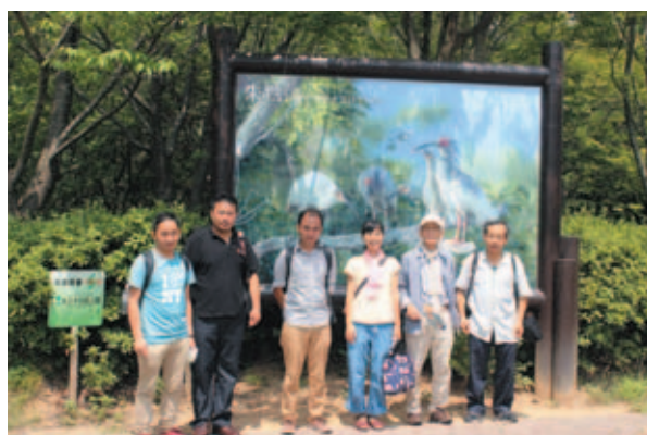
Photo 2 Sado Island