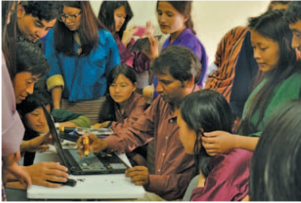
Photo 5 Student learning computer hardware