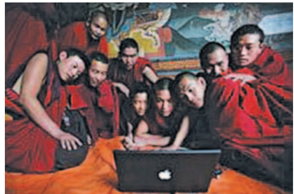
Photo 10 Monks trying out a laptop